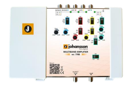
Ref. 7785 5 inputs: BI/FM, BIII/DAB, UHF1, UHF2, SAT