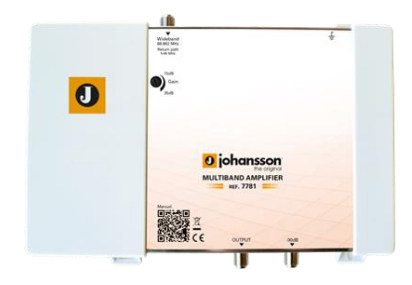
Ref. 7781 1 input: Cable