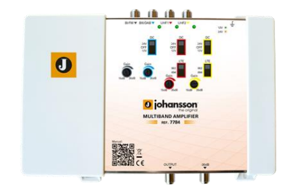
Ref. 7784 4 inputs: BI/FM, BIII/DAB, UHF1, UHF2